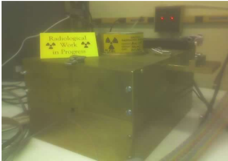
Temperature controlled brass radiation enclosure box.